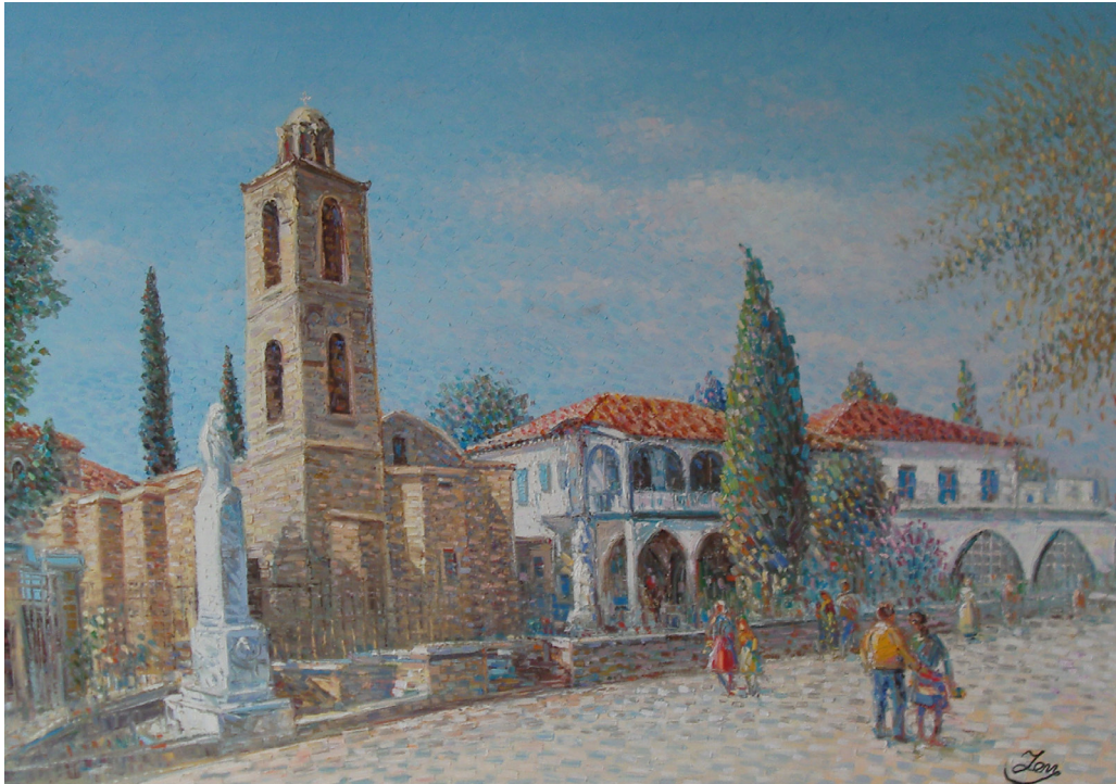
43. Vasilis Zenetis Agios Yiannis and Old Archbishop Palace, Nicosia Cyprus

signed and inscribed on reverse, oil on canvas 70 x 100 cm